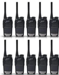
10 PACK Hytera TC-320 Portable Radio UHF 400-470 MHz 1700mAh Li-Ion Battery