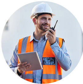
Two Way Radios