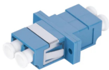
10 PACK Duplex Fiber Optic Coupler Module LC/UPC to LC/UPC Single Mode Fiber